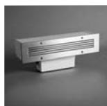
L2158W-N-J Stainless Steel