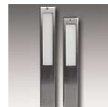
C1392W-LED-2 C1392W-LED Two sizes shown 14-3/16" x 2", 12-3/4" x 2"