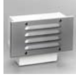
L252-N Stainless Steel 5-5/8" x 9-3/8"