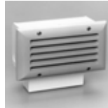
L252W-L26-J 5-5/8" x 9-3/8"