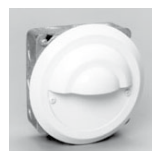
L150E 5-3/8" dia.