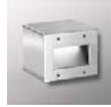
SL603W-N 4"x5" Surface. Also available in: L606-L609-L612 sizes