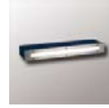
L509W 1-9/16" x 12-3/4"