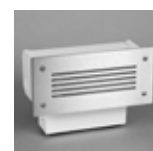
L158W-N-J Stainless Steel