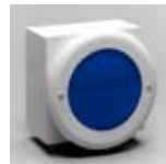
L150G/PA-BLU 5-3/8" dia.