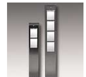
C1392D-LED-2 C1392D-LED-4 2 and 4 window 12-3/4" x 2", 16-5/8" x 2"