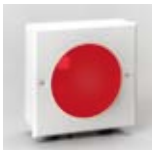
L150G-RED 5-3/8" sq.