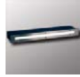
L512W 1-9/16" x 15-3/4"