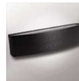
L2600W-2-ST/ST FannyPack XL