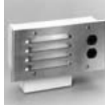
L252-N-CO-J 5-7/8" x 11-5/8"