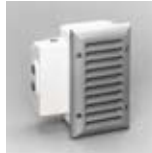
L252W-L26V-J 9-3/8" x 5-5/8"