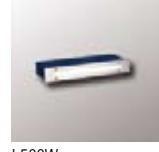
L506W 1-9/16" x 9-3/4"