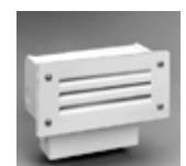
L158W-SCL-WHT-J Sharp Cut-off Louver