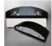
L2500W-1-EGR FannyPack Egress