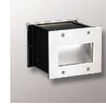
L603W-2S-N 4"x5" Thru-wall