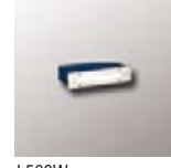
L503W 1-9/16" x 6-3/4"