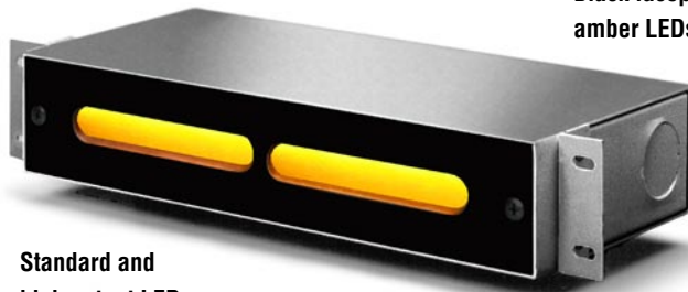
L159W-BLK-AMB — Black faceplate and amber LEDs

Standard and high output LEDs are available in a variety of colors.