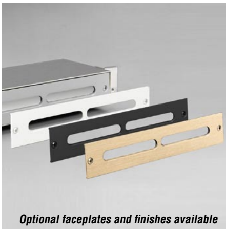
Optional faceplates and finishes available