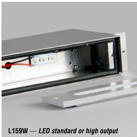
L159W — LED standard or high output